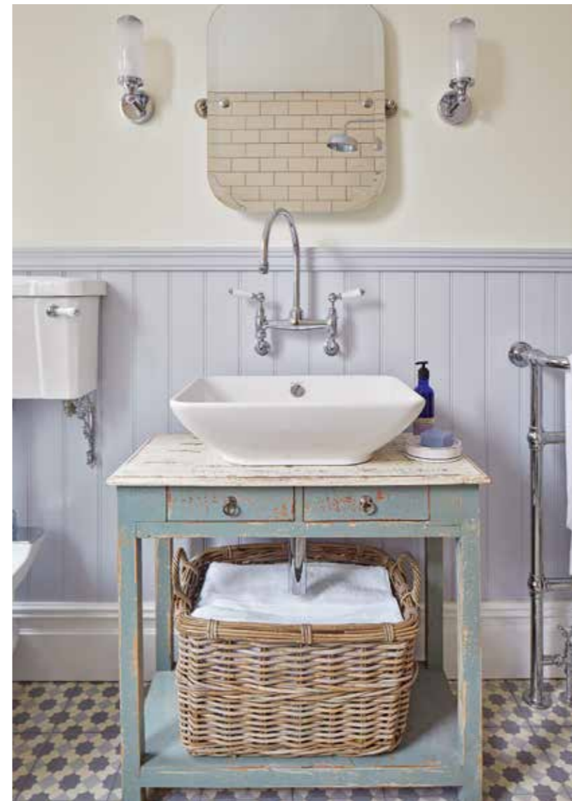
FEATURE CAROLINE FOSTER STYLING DILLY ORME PHOTOGRAPHS DAVID PARMITER PLAN PERSONA>ID

▲ Perfect fit The roll-top bath is in keeping with the house's heritage. 'I was tempted to paint it black, but a white finish keeps the room light,' says Katie Hampton showering bath, £779, Burlington. Bath taps, £180; shower rose, £115; diverter valve, £293; overhead shower arm, £181; thermostatic shower valve, £492; all St James range, Marlow