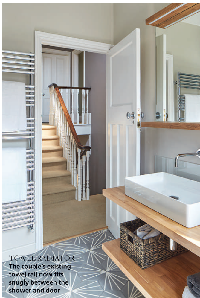
TOWEL RADIATOR The couple's existing towel rail now fits snugly between the shower and door