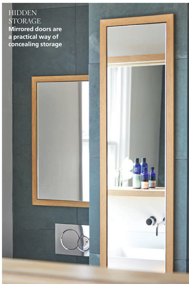
HIDDEN STORAGE Mirrored doors are a practical way of concealing storage